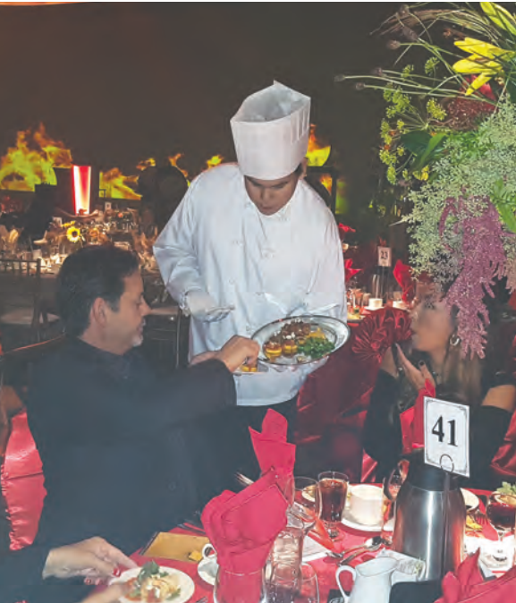
Guests sample the appetizer created by Tasty Towne Catering