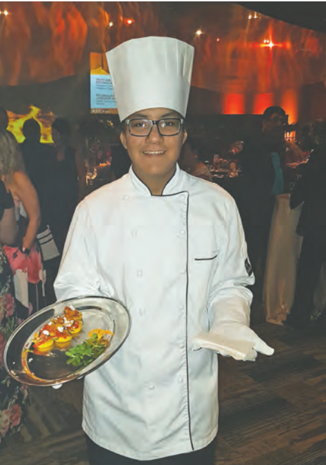
Michisotān - Let's Eat!