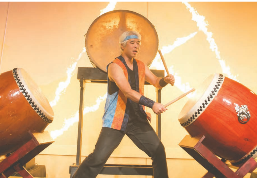
Living Sky Taiko