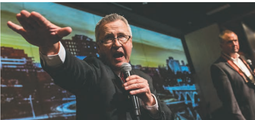
The Live Auction gets going and another bid comes in