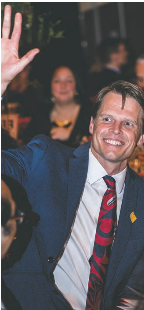
Mayor Charlie Clark