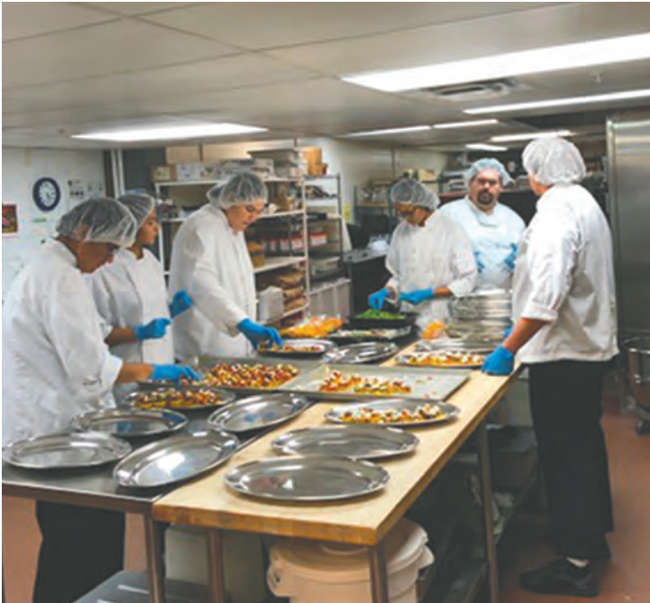
Prepping in the kitchen