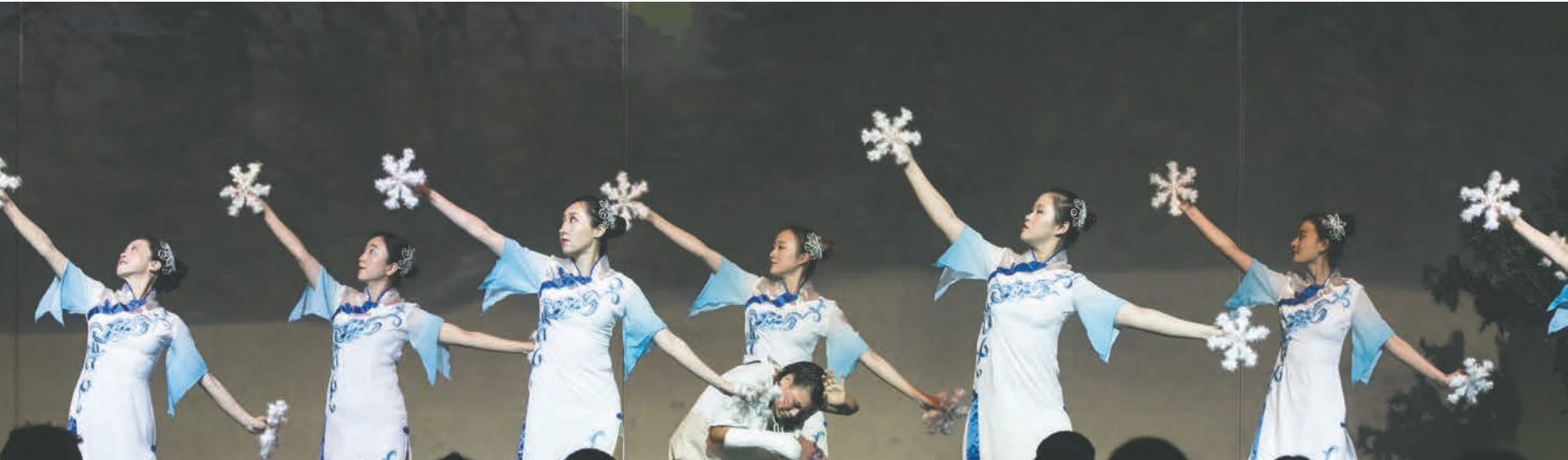
Winter winds are coming