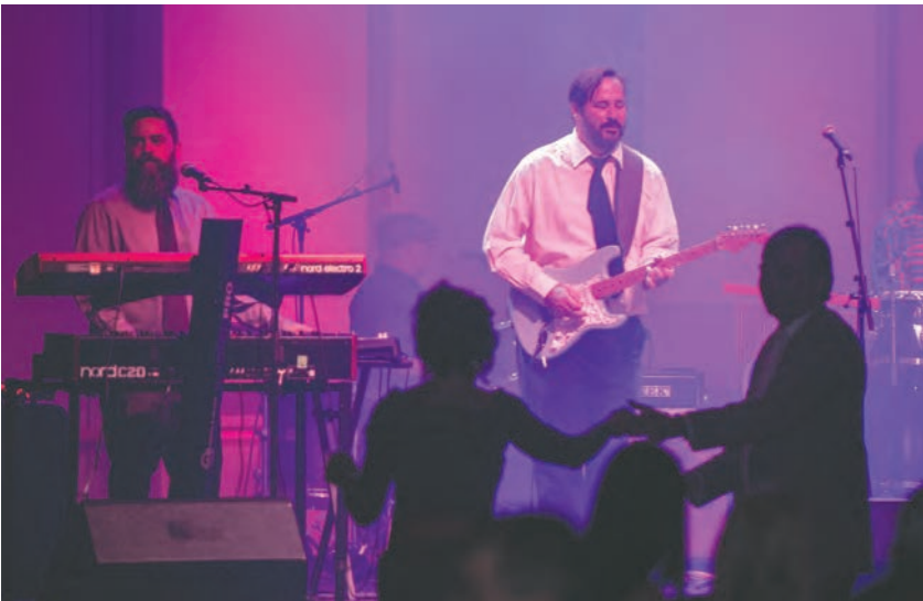
Randy Woods Band keeps fanning the flames of this party!